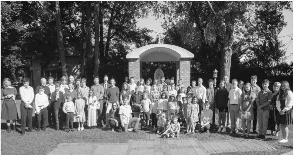
Faith Formation Group 2021